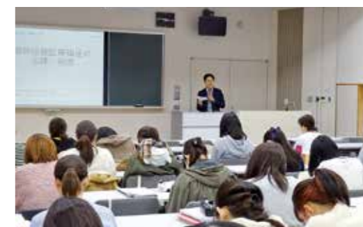
上：大学院における研究指導 Image above: Receiving postgraduate research guidance 下：学部生に対する授業風景 Image below: A scene from an undergraduate class