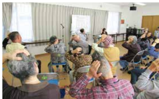
上：ホストマザーと（ニュージーランド研修） Image above: With host mother (New Zealand study program) 下：エコノミー症候群予防体操（災害看護サークル） Image below: Economy-class syndrome prevention exercise (Disaster nursing club)

Through various activities involving nursing and the local community, I am really enjoying university life.