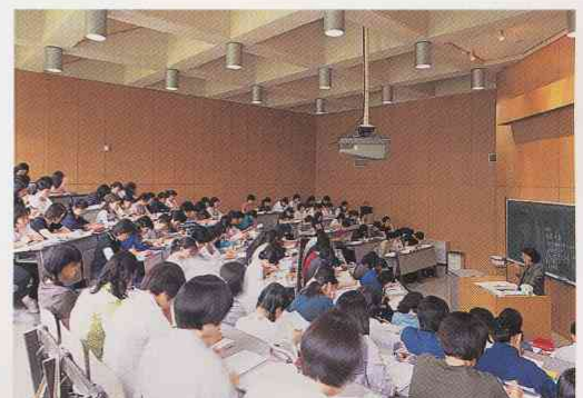
Joint lecture room