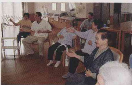
Outreach in community